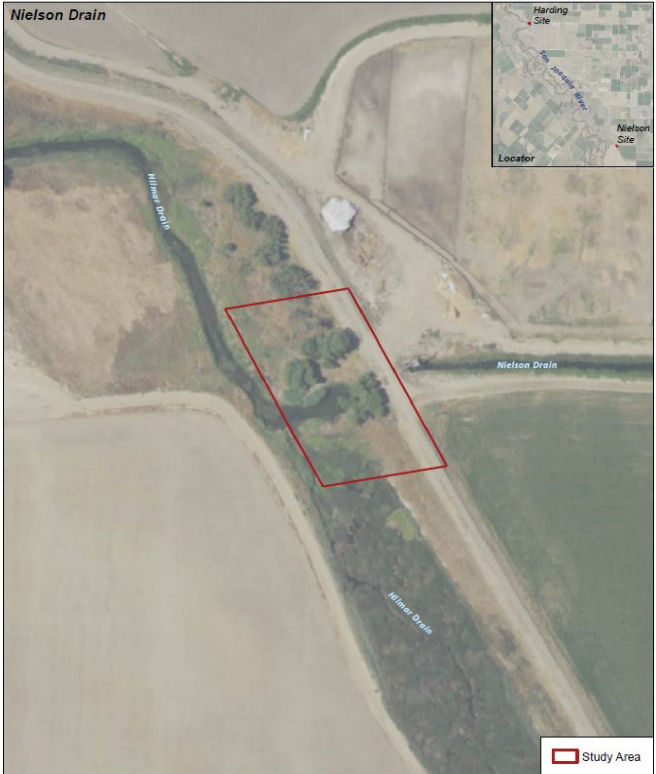
3) Project footprint map