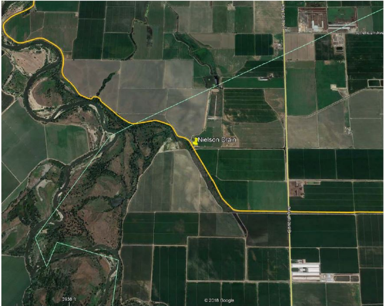
2) Location map